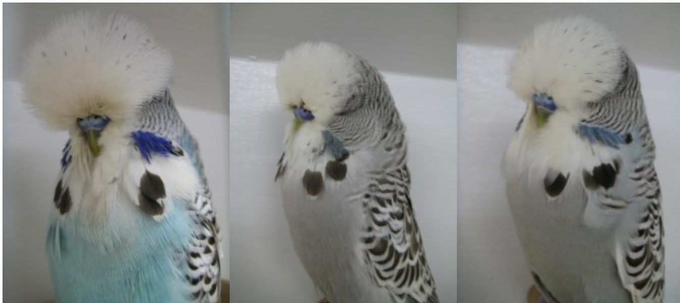
O'Callaghan Family (N & C Qld)