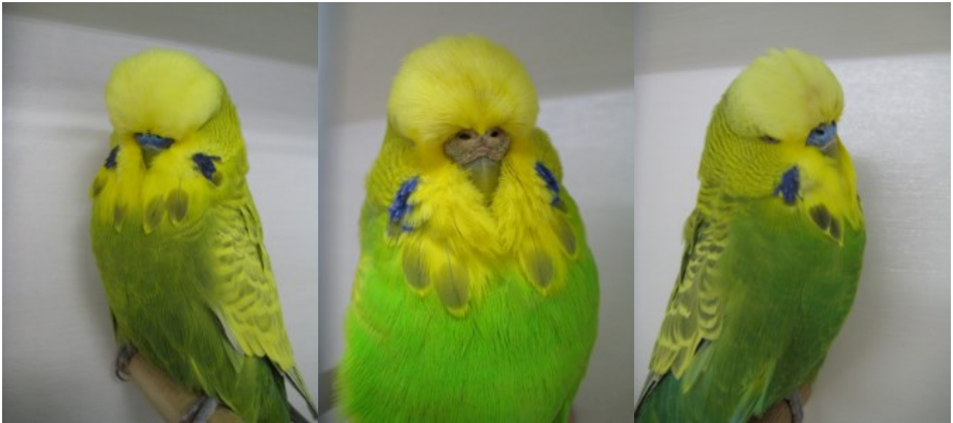
Howard & Home (Tas)