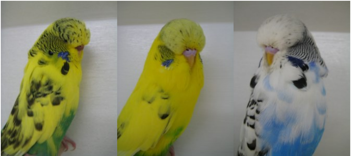
V & K O'Reilly (South Qld)