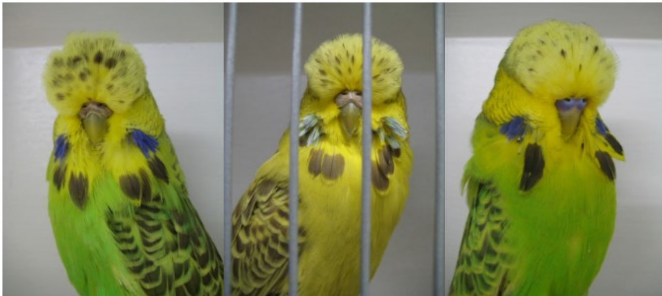
Belcher & McKellar (Vic)