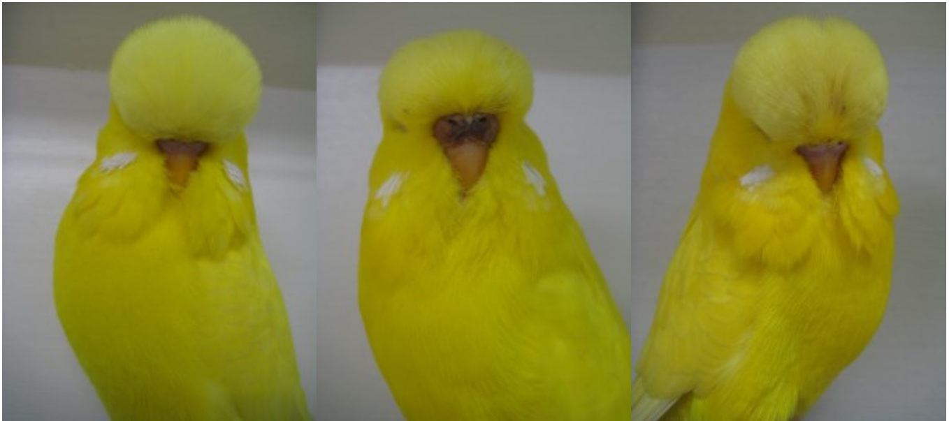
R Loats Estate (Vic)