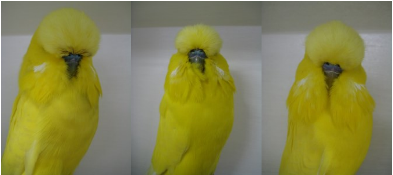
Blair & Poole (Tas)