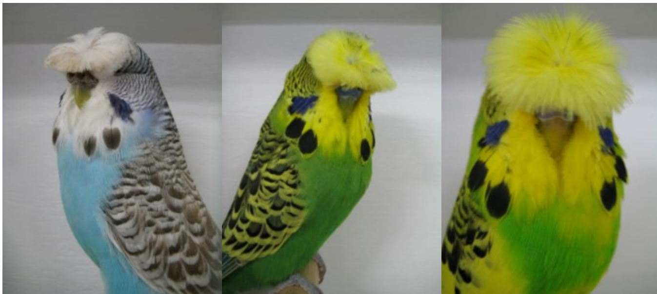
Sheppard & Flanagan (Vic)