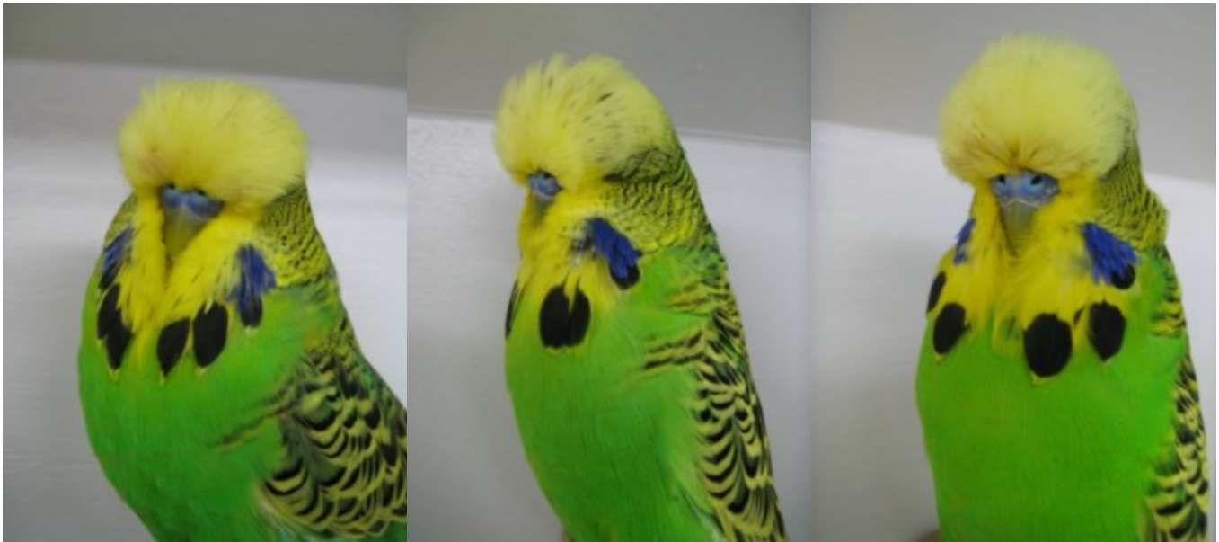
A Rowe (Vic)