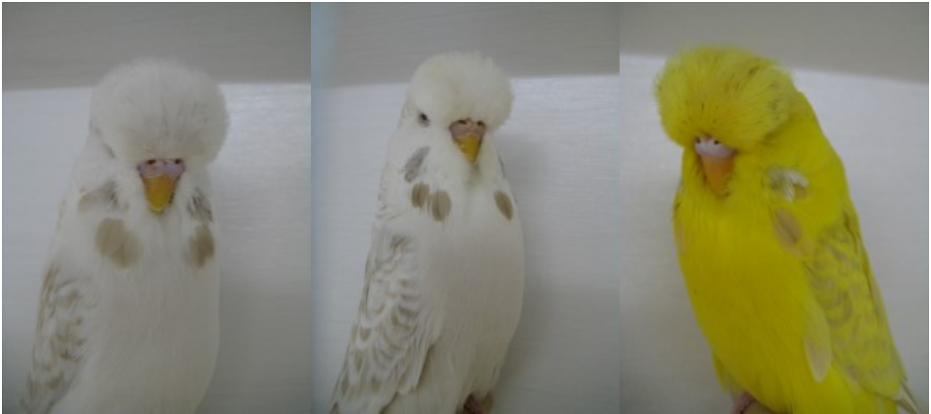
Wright Family (South Qld)