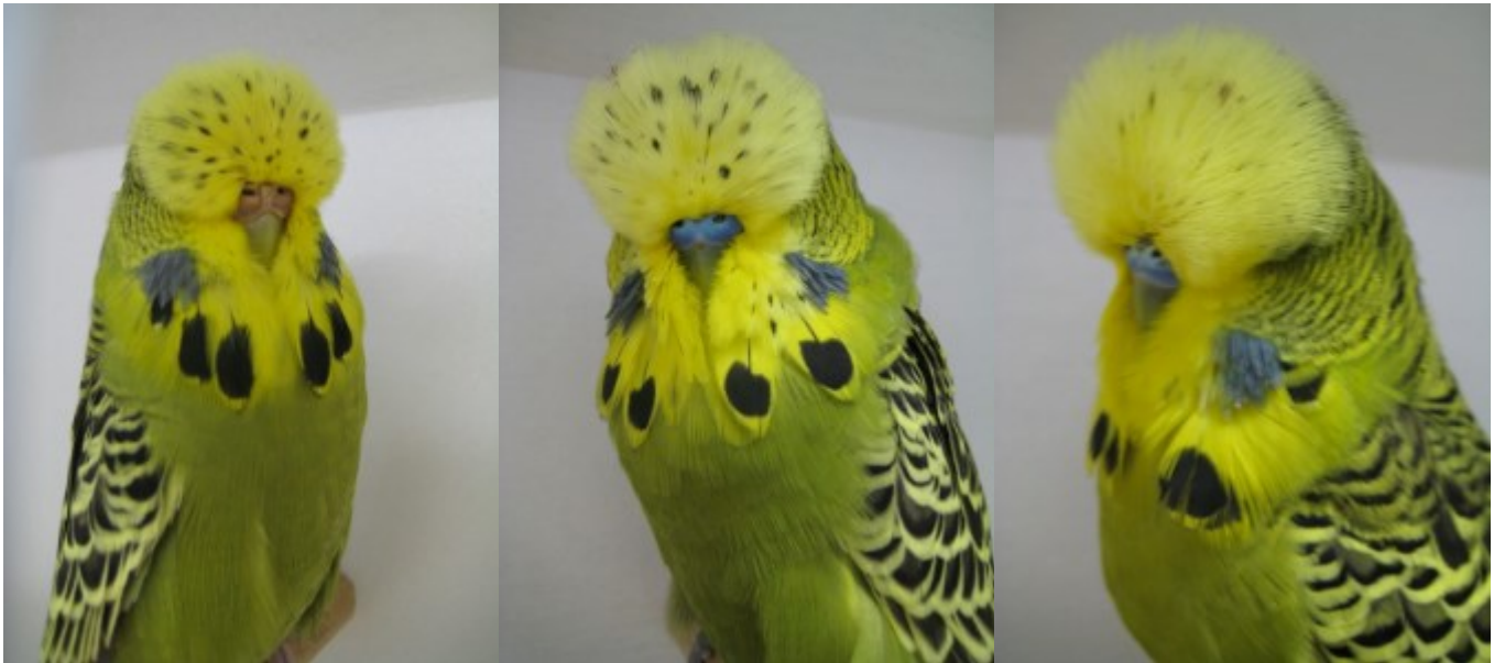
Welshman Family (NSW)