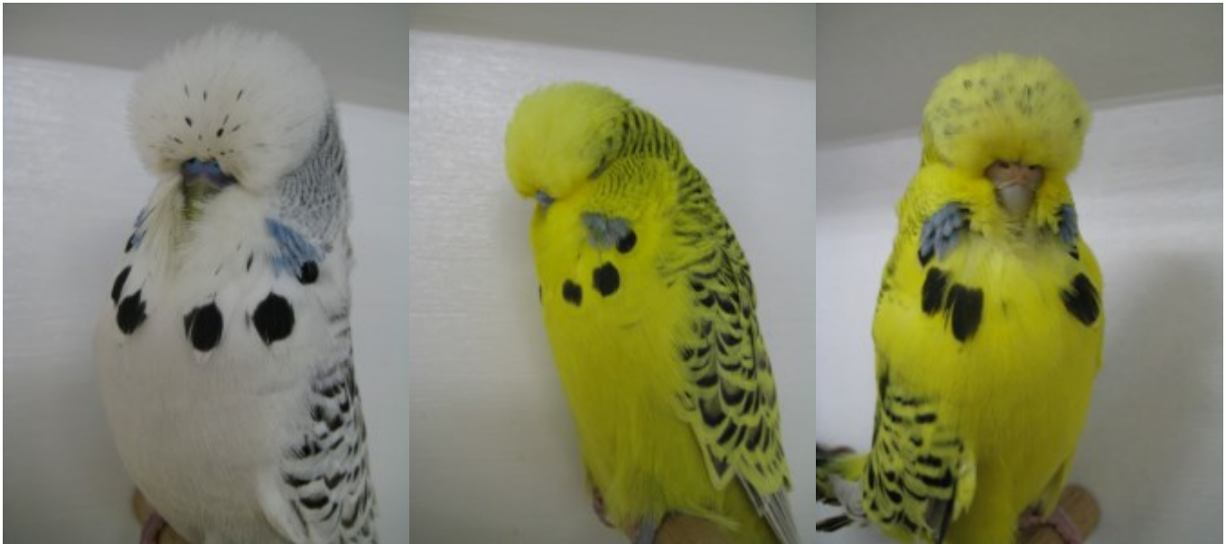
P Thurn (Vic)