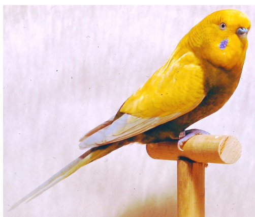
Clearwing Olive Photographed by Harry Nott of NSW in 1962

This would not only be an advantage in increasing numbers but also preserving their individual characters thus providing the essential Stock Birds to improve colour and feather in most varieties.