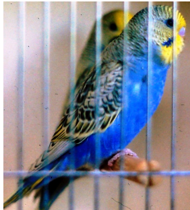
Bryce Gringlington – 1978 - Golden Face

Brian Dadd and Bryce Gringlington in Melbourne must have bred thousands of these birds however many were not what the Standard stated for a show bird, the rest were stock or pet birds. Bryce would have been the first to breed Golden Faced Violet Spangles which were SPECTACULAR to see.