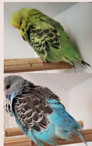
(French Mould photographs courtesy Ipswich BS)